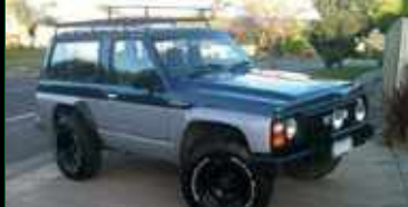
Y60 GQ SWB Wagon 1988 to 1998