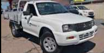
MK L200 1996 to 2006