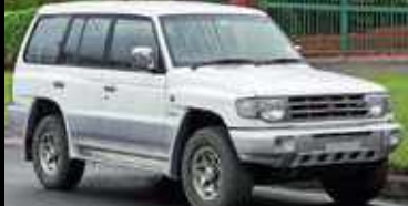
Montero NH-NL (Leaf) 1991 to 1999